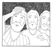
Master, it is good that we are here